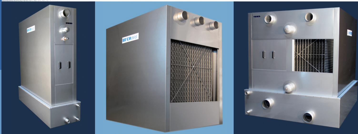
PIC LEFT TO RIGHT BUCOdelot compact system with tank, power 100 kW - dx; BUCOdelot typ A, power 1000 kW; BUCOdelot typ B, power 2000 kW